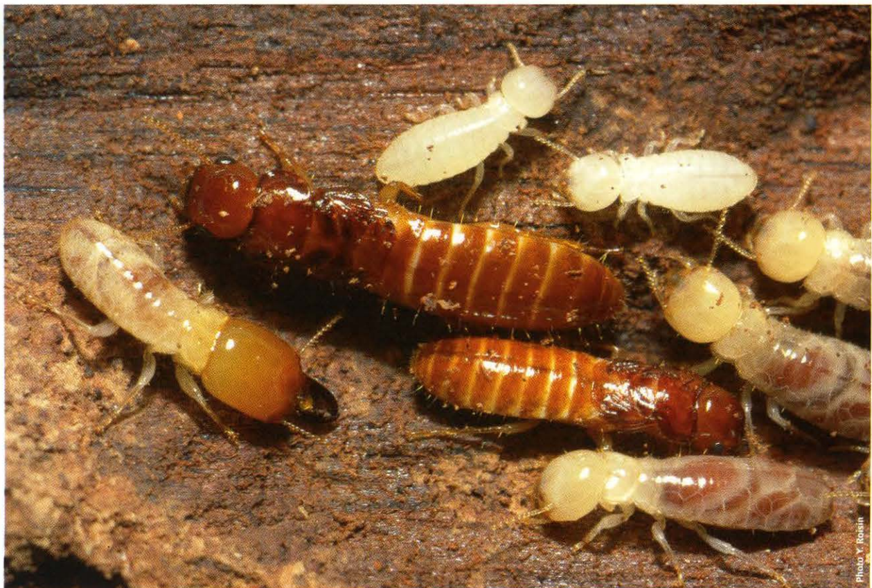
Figure 158: Part of an incipient colony of Neoterme sp., showing the royal pair (reddish brown), a soldier (left, with heavily sclerotized head and long mandibles), two larvae (top, white), and large working immatures (right, with pale head and reddish digestive tube).

As is the rule for southwest Pacific islands, the termite fauna of Santo is exclusively composed of wood feeders. Endemism of termites on Santo is probably low. Both Termitidae species and Procrhinoterme inopinatus are widespread in the southwest Pacific region. The geographic distribution of the two Cryptoterme species is probably extensive as well: C. tropicalis was described from Queensland, Australia, and C. albipes from the Loyalty Islands. This latter species also occurs in New Guinea (YR, unpublished). However, the identification of the other Kalotermitidae is still in progress. The lack of clear correspondence between our collections and published species descriptions suggests that some species might ultimately prove to be new, and perhaps endemic.