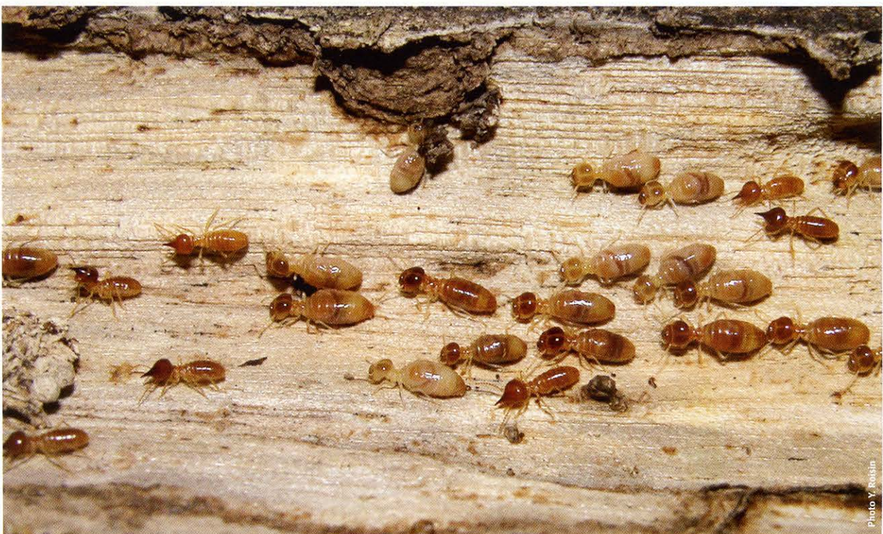
Figure 156: Soldiers (with pointed head capsule) and workers of Nasutitermes novarumhebridarum . Tunnel made of wood carton was opened to show walking termites.

Known as drywood termites, the Kalotermitidae form small colonies confined to single pieces of wood on which they feed. Soldiers do not possess a frontal gland, but defend their colony by blocking passages in the wood with their head, which is often heavily thickened and endowed with powerful, crushing mandibles (Fig. 157). When their home piece of wood approaches exhaustion, most of the individuals will proceed to the winged, alate stage and attempt to found a new colony in another site. This is the most species-rich family