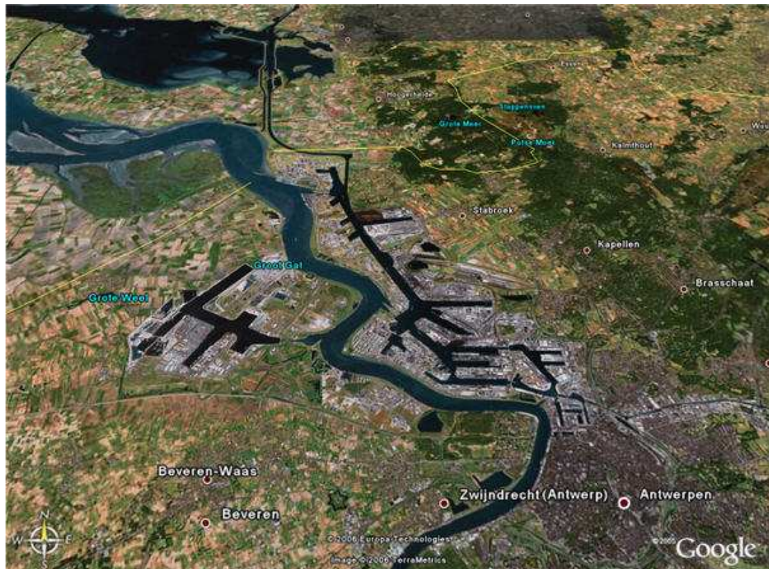
Satellite view on Antwerp, its Harbour and 'Het Verdronken Land Van Saeftinghe' (green zone in the upper left part of the photograph, just below the river meander)