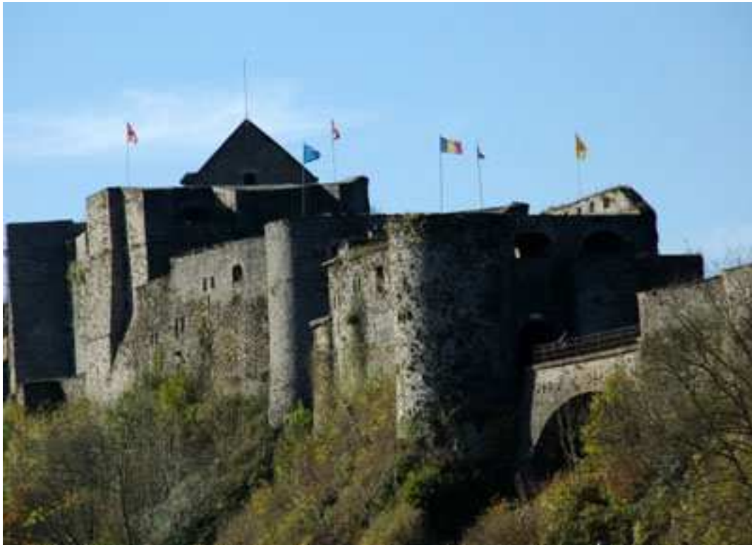
The Castle... and its 'ingredients'...