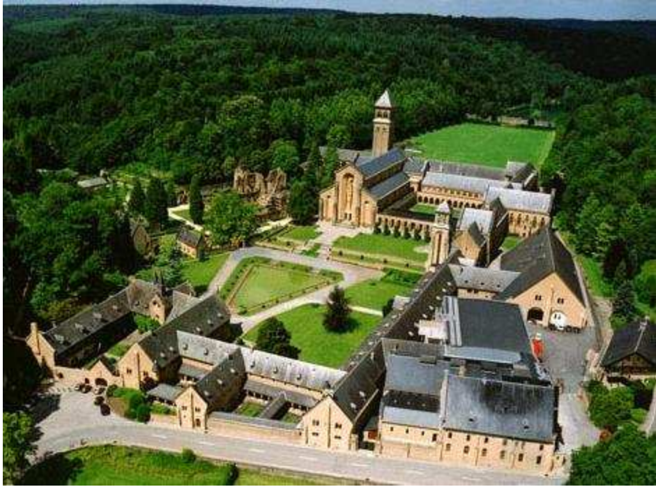
In Orval life is more peaceful....