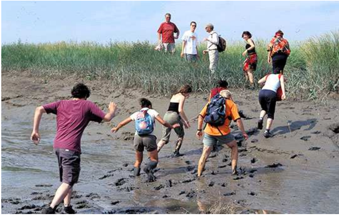
Be prepared for mud...