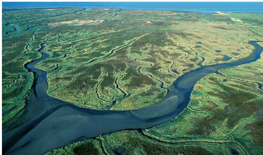
Aerial view of 'Het Verdronken Land van Saeftinghe' (cf. green area in the upper left corner of the previous photograph)