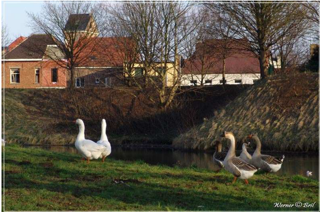
Lillo... rural romance in the shadow of a harbour...