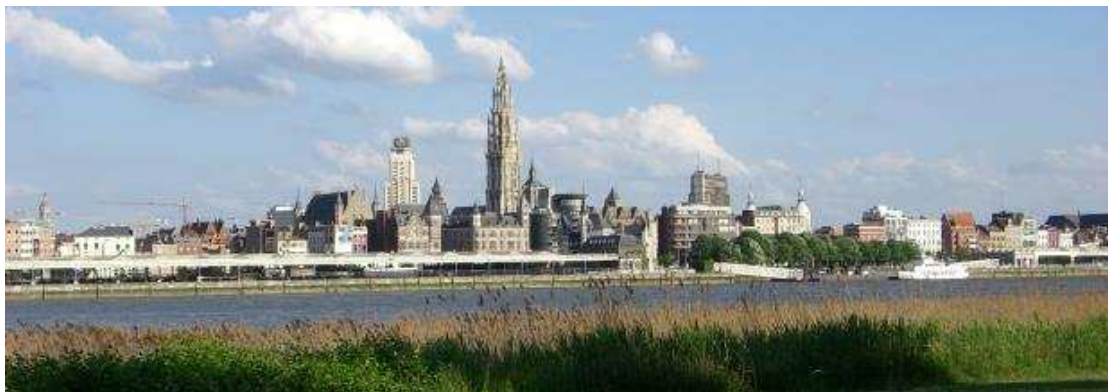
Skyline of Antwerp, seen from the left bank of the river Scheldt

Prices for the trips include the bus trip, guides, renting of the bikes (biking trip), entrance to three museum and beer tasting (Brugge), entrance to the castle, monastery and beer tasting (Bouillon) and visit to the visitor centre (Saeftinghe). However, food and additional drinks are NOT INCLUDED! Below you will find specific information for each trip. PARTICULARLY FOR THE PARTICIPANTS OF THE TRIP TO SAEFTINGHE THIS INFO MAY BE VERY IMPORTANT, AS WELL AS FOR THE PARTICIPANTS OF THE BRUGGE TRIP THAT WANT TO HAVE DINNER IN THE BREWERY!!!